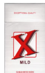
X Mild Kreteks by Bentoel, the 6 th most popular machine-rolled kretek in Indonesia

TTCs are fully aware of the additional dangers of kreteks. Over ten years ago, BAT sought to develop a kretek-like product in Indonesia containing levels of eugenol that exceeded international guidelines for eugenol uptake. 12 At that time, the company chose not to bring the product to market fearing bad publicity from marketing a product in Indonesia that could not be marketed in other countries.