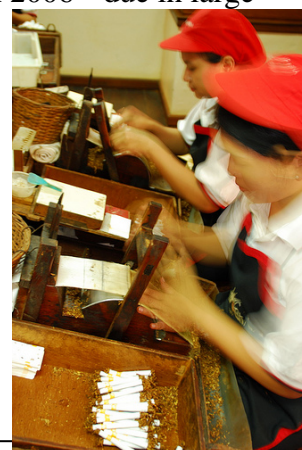
Women hand-rolling cigarettes, Sampoerna