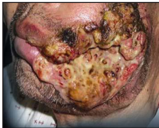
Smoking causes mouth cancer