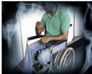
Smoking causes strokes