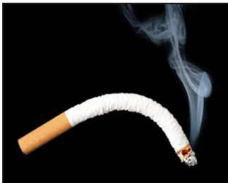
Tobacco use makes you impotent