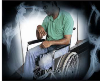
FUMER PROVOQUE L'ATTAQUE CÉRÉBRALE