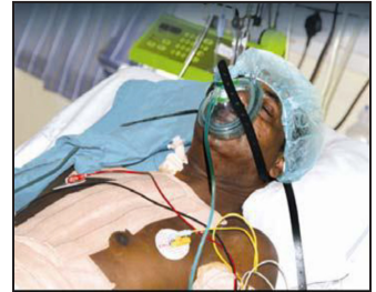
FUMER CAUSE UNE MORT LENTE ET DOULOUREUSE