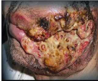
FUMER CAUSE LE CANCER DE LA BOUCHE