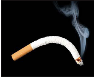
L'USAGE DU TABAC PROVOQUE L'IMPUISSANCE SEXUELLE